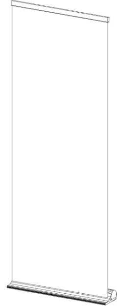
(33.5"W model shown here)

Please refer to the following Art spec sheet for any further information.