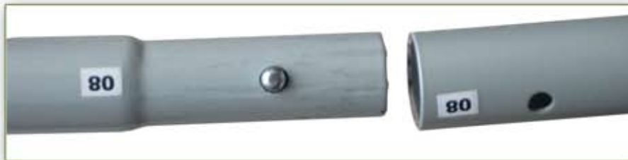
Above - Labelled pop-button connectors make setup a snap!

Kits include fabric print, interlocking aluminum frame, and carrying case (below). Hard shell case and lighting available