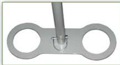
Left - Sturdy weighted feet to make sure your booth stands firm!