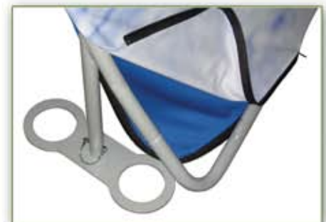
Right - Graphic sleeve slips over the top of the frame and zips along the base.